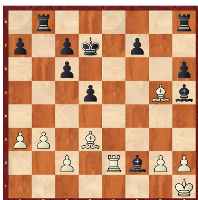
4. White to play and mate in 2