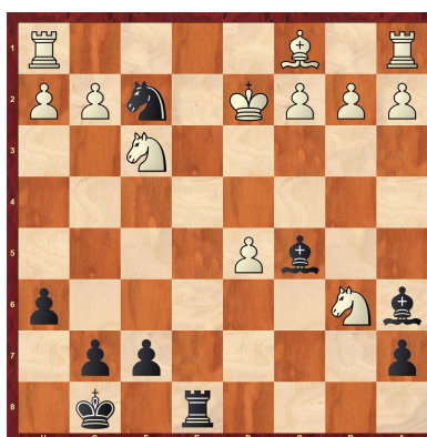
5. Black to play and mate in 2