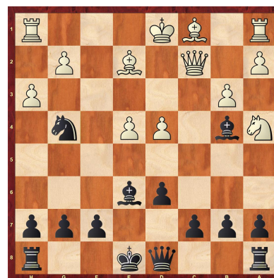
3. Black to play and mate in 1