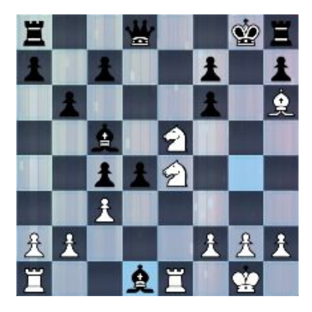
Difficulty: Medium Black to Play With Mate in 3